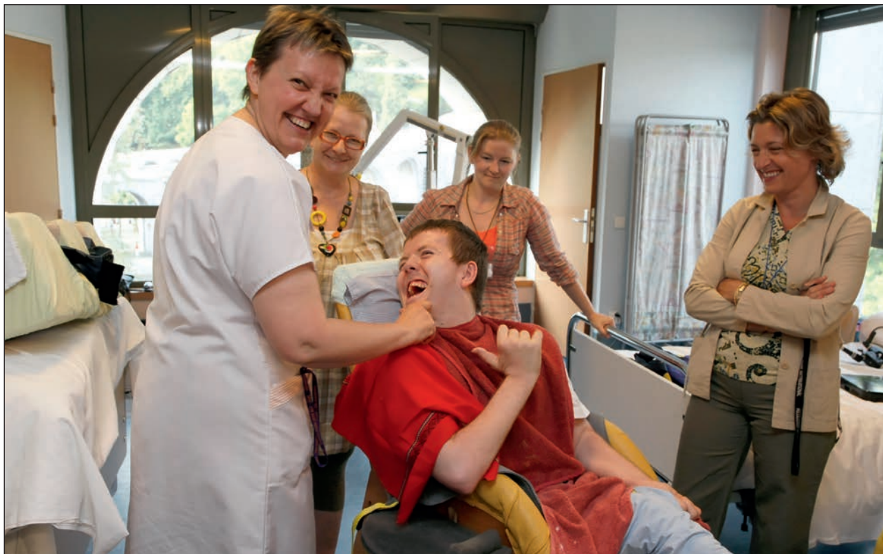
Serving the sick at the Accueil Notre-Dame.