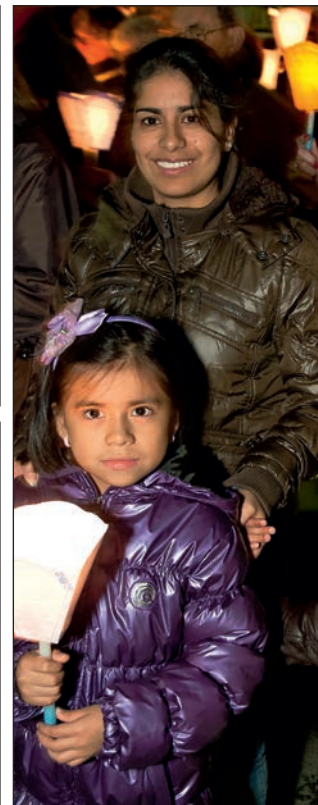
The pilgrims from other continents are more and more numerous.