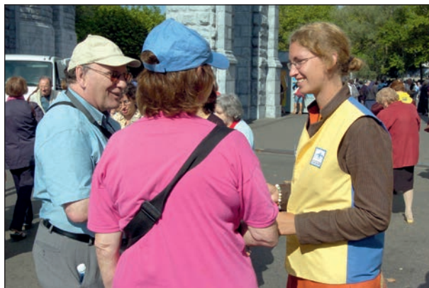
A “pilote” at the service of pilgrims.

“I dream of a ‘missionary option’, that is, a missionary impulse capable of transforming everything”,