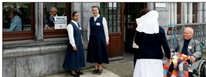
Several Communities work at the Mass Bureau in the Sanctuary of Lourdes: The Ploërmel Brothers, the Sisters of the Society of Helpers of the Holy Souls, the Daughters of the Most Immaculate Virgin of Lourdes, the Sisters of Saint Joseph of Tarbes, the Sisters of Saint Joseph of Saint-Marc (our photo), and the Casa di Maria (consecrated lay Italians).